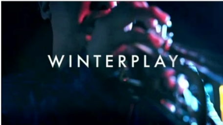
Winterplay's cover of Prince's "Purple Rain" as tribute for Prince's birthday.

An Asian jazz band celebrates Prince's birthday with a musical tribute. South Korea-based pop-jazz band Winterplay released a rendition of Prince's 1984 hit "Purple Rain." The band says it decided to cover the song after hearing of no planned tributes to mark the event in Asia. Prince died in April of an accidental overdose of painkillers. His 50th birthday would have been June 7.