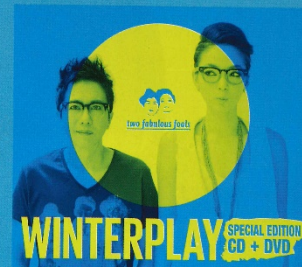
Winterplay 最新專輯《Two Fabulous Fools》加推 CD+DVD 特別版，DVD 收錄四首 MV 及一段紀錄片，在等待她們來港表演演唱期間，先來一點視覺新刺激。